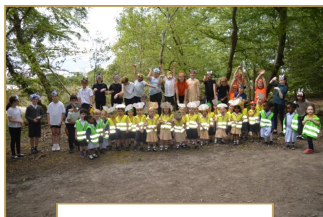
The Big Toddle