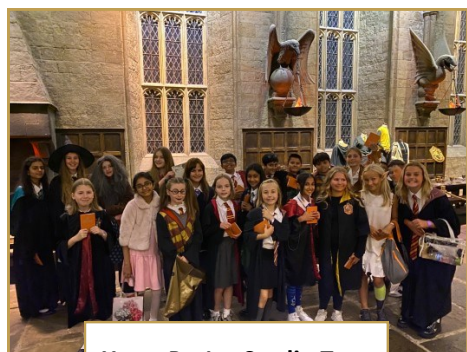
Harry Potter Studio Tour

At Oaklands, Year 4 and 5 had a fantastic three-day adventure at the Young Mariners Base. They learned many new skills including raft building, rock climbing, paddle boarding, archery, canoeing, sailing, kayaking and a range of other team building activities. All of our children enjoyed these new experiences.