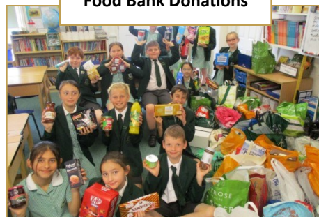
Food Bank Donations

Oaklands pupils and their families collected an amazing amount of donations for Epping Forest Food Bank. The foodbank continues to play a vital role in reaching more people with the support they need. The children learned about citizenship and how they can make a positive difference within their local communities.