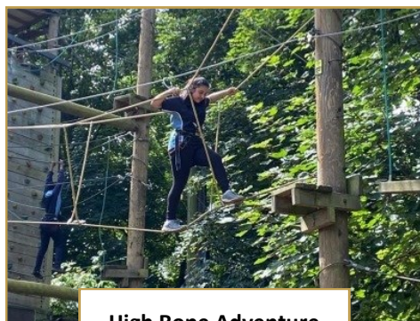
High Rope Adventure

Year 9 enjoyed overcoming their fears and taking high rope adventures. Pupils kept their balance along ropes suspended between trees, wobbly bridges and wooden beams, before zip lining their way down at the end of the trail.