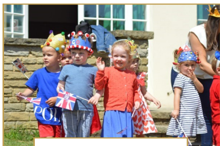
Coopersale Hall School

At Coopersale Hall the whole school was treated to an afternoon tea under the trees. Parents were then invited to join the pupils, who put on an entertaining show for them. After performing the National Anthem and several British favourites, the children donned their carefully created crowns and gave everyone a royal parade, complete with the Queen's signature hand wave.