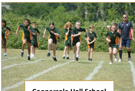
Coopersale Hall School

Reception, Years 1 and 2 pupils took part in obstacle races, bat and beanbag races and flat races. Finally in the afternoon it was the turn of the Juniors, where each year group took it in turns to earn points for their House over a number of events. Once all the points had been added up, it was announced that Willow House were the winners.