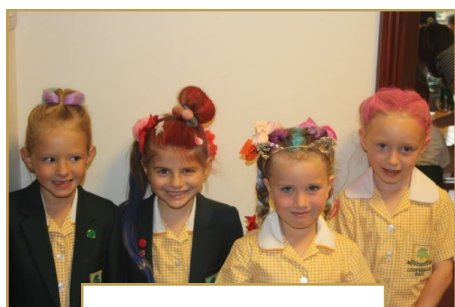
Mad Hair Day

Coopersale Hall pupils enjoyed coming to school with some seriously crazy hair! Teachers also got into the spirit of the day and came with equally crazy hair.