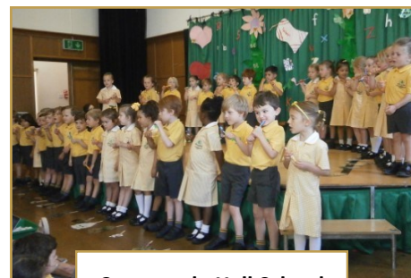
Coopersale Hall School

As part of their topic on 'minibeasts', the children in Upper Kindergarten made their own wiggly worms by carefully threading beads on wire.