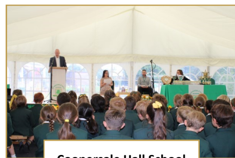
Coopersale Hall School

awards given for other successes such as the Oak-Tree Challenge and specific subject prizes.