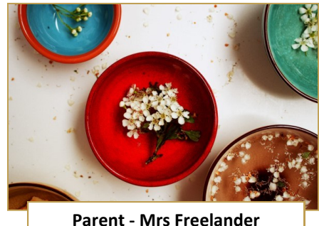
arent - wirs rreciander