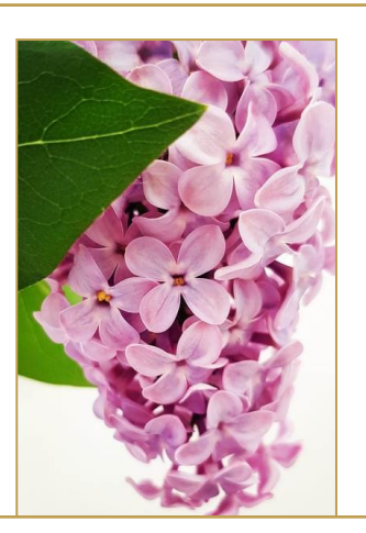
High Commended - Irina - Year 1