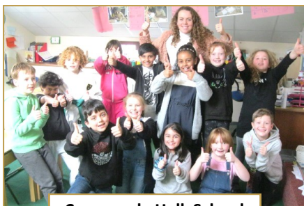
Coopersale Hall School

for Water Aid this year. Two Year 4 school councillors produced a wonderful poster and even spoke to the rest of the school during an assembly about the importance of this charity. Pupils also raised money for Whittingham Kennels, a local animal charity in Waltham Abbey, by coming into school in non-uniform in return for a small donation. The Year 2 school councillors took the lead with this event, and read out their findings about the charity in an assembly.