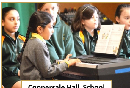
Coopersale Hall School

During the last week of school, Coopersale Hall's talented musicians performed a fantastic piano assembly. Ranging from beginners to advanced they all performed confidently in front of a large audience to showcase what they have been learning in their individual piano lessons.