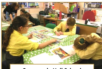
Coopersale Hall School

Woman with Hat, using vibrant layers of pastel to great effect.