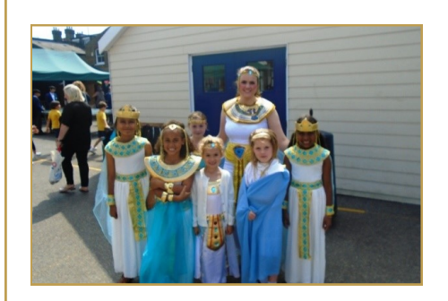
During Humanities Week. Normanhurst Junior pupils enjoyed a

historical dress up day. Staff and pupils made a huge effort with homemade costumes, props, fancy wigs and even makeup.