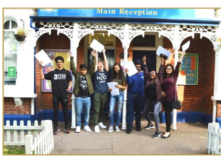
Normanhurst Exam Results

Year 2 became Town Planners last term. They have been learning the meaning of collaboration, compromise and communication by working together to make town maps in House teams.