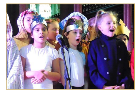
Coopersale Hall Carol Service

Nativity using song and dance. The energetic 'Oh What a Night' made a fantastic grand finale!