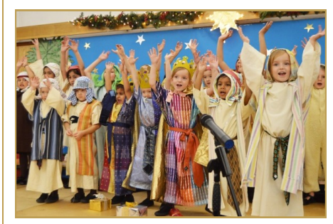
Braeside Junior Nativity

Braeside packed its end of term calendar with lots of Christmas events and activities. The younger children started their festivities with a trip to the post box to send their letters to Santa. Pupils enjoyed their Christmas lunch, panto visits, the FOBS Christmas Fayre, Christmas-themed crafts sessions and Christmas Jumper Day. They also enjoyed performing in the Carol Concert and Nativity.