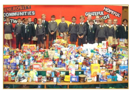
Coopersale Hall Harvest Donations

Hall enjoyed Coopersale pupils Harvest by hosting two very special assemblies. Reverend Lee Baston came to talk to the children about the before story of Harvest thev performed a range of songs and poems including 'A Harvest Prayer', 'Bigger and Bigger' and 'Autumn Days'. The donations filled up the whole stage and were later delivered to Pelly Court Care Home.