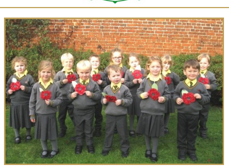
Coopersale Hall Poppy Making

Some of the children at Coopersale Hall made their own poppies in class while learning about why people wear poppies on this special day.