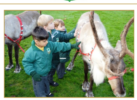
Coopersale Hall and some Special Visitors

Along with 40 other ISA Schools, the Oak-Tree Group are working to help raise the funds to set up the first school in the remote community of Pong Tek in Cambodia. The school will have a transformational impact on the