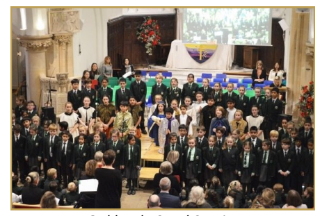
Oaklands Carol Service

Church for their Carol Service. The audience was treated to a moving retelling of the Nativity story using a range of songs, carols and Bible readings. It was a lovely way to get everyone in the Christmas spirit.