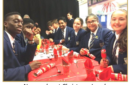
Normanhurst Christmas Lunch

Normanhurst pupils had a lovely lead up to Christmas, with pupils enjoying a delicious Christmas dinner together in the hall. Early Years and Infants gave three fantastic performances of their Nativity play to parents and the whole