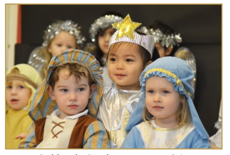
Oaklands Garden Room Nativity

school took part in a festive Christmas Carol service. There were also visits to the local pantomime, Christmas crafts, concerts at the local care home and lots more to help get everyone in the festive spirit.